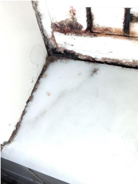
Mold on walls after they were washed with bleach