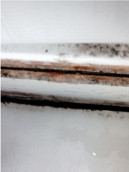
A wall with mold