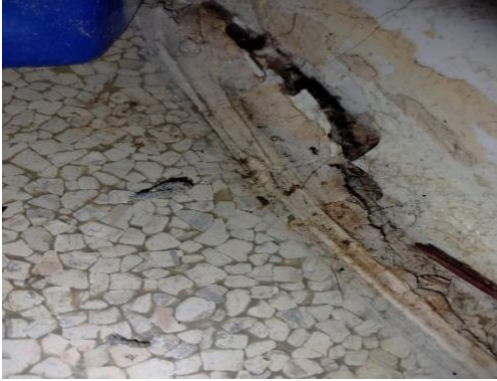
Crack in foundation